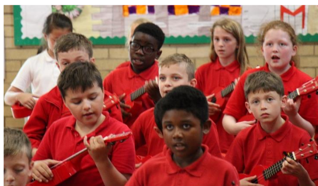
Year 4 ukulele concert