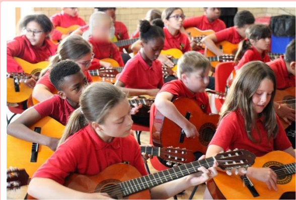
Year 5 guitar concert