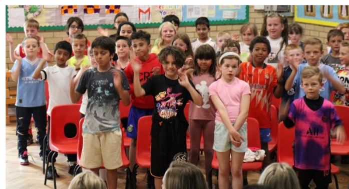
Year 3 music concert